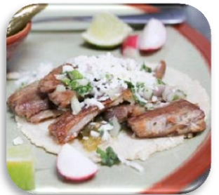
Lone Star Taco Bar

A handy guide for new Overdrive employees* on where to eat for lunch in Allston and nearby areas Bonus points for these restaurants: they offer delivery and/or take-out!